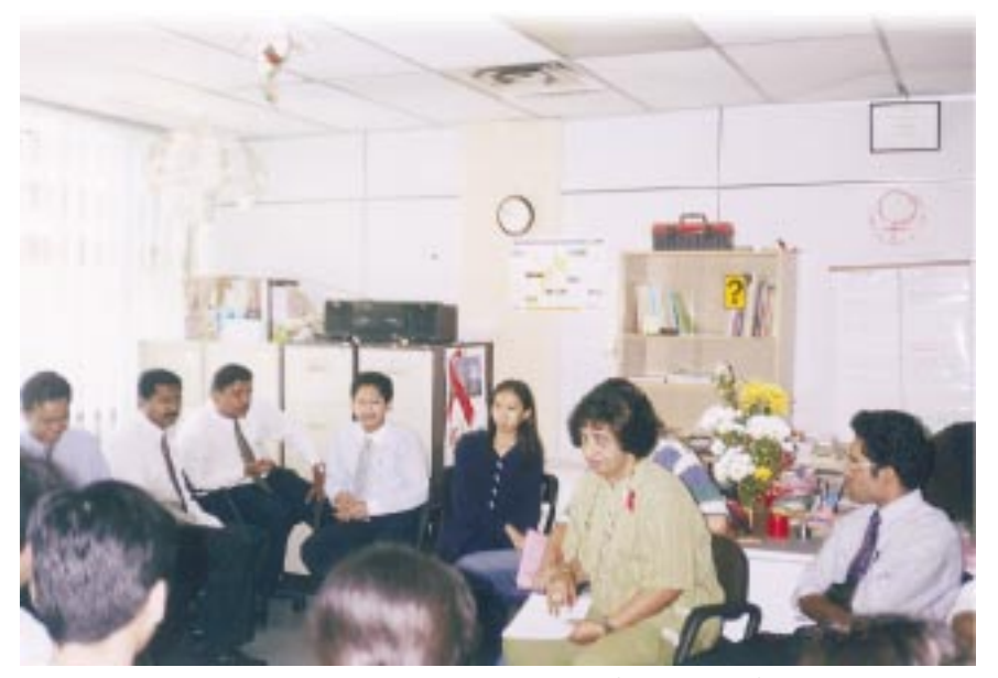
Tenaganita's young lawyers' legal clinic

Intervention in the Philippines, in favor of returning migrants was traditionally delegated to the Overseas Workers Welfare Administration (OWWA), a private fund established originally with contributions from employers, but largely sustained now with contributions from migrants before going abroad. However, the Migrant Workers and Overseas Filipinos Act of 1995 (RA8042), providing for an overall approach to migration, includes also a provision concerning return migration. Articles 17 and 18 provide for the establishment and the functions of the Re-placement and Monitoring