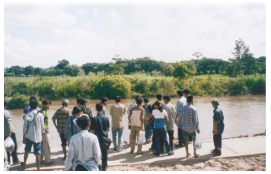
Burmese Migrants being deported from Thailand (Nov1999)

Experiences that the migrant workers go through at the pre departure and post arrival stages, impact their re-adjustment process. Similarly, issues and experiences of migrant workers during the process of reintegration impact their decision to re-enter