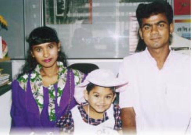
Bangladeshi family. Father / mother working in Malaysia Child born in Malaysia

In 1999, Tenaganita handled the case of a Bangladeshi woman who had a customary marriage in Malaysia with another Bangladeshi migrant worker and later delivered a child. Tenaganita had to intervene with the Bangladesh Embassy in Malaysia, the Malaysian Ministry of Foreign Affairs and the Malaysian National Registration Department to facilitate repatriation of the woman with her child.